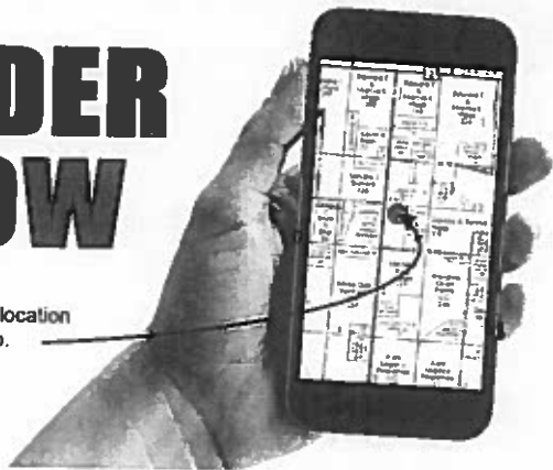
Your GPS location on the map.

Go to Map Store to select the state and county you wish to purchase. Download available immediately after purchase. Installation instructions included.